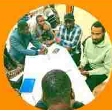
Zimbabwe summit 2025 pictures

Nigeria Evangelical Missions Association